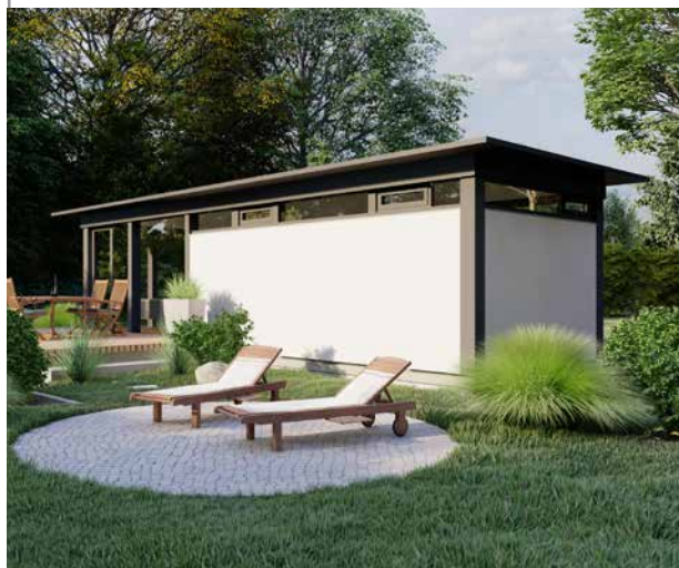
7 HANDOVER MOVE IN