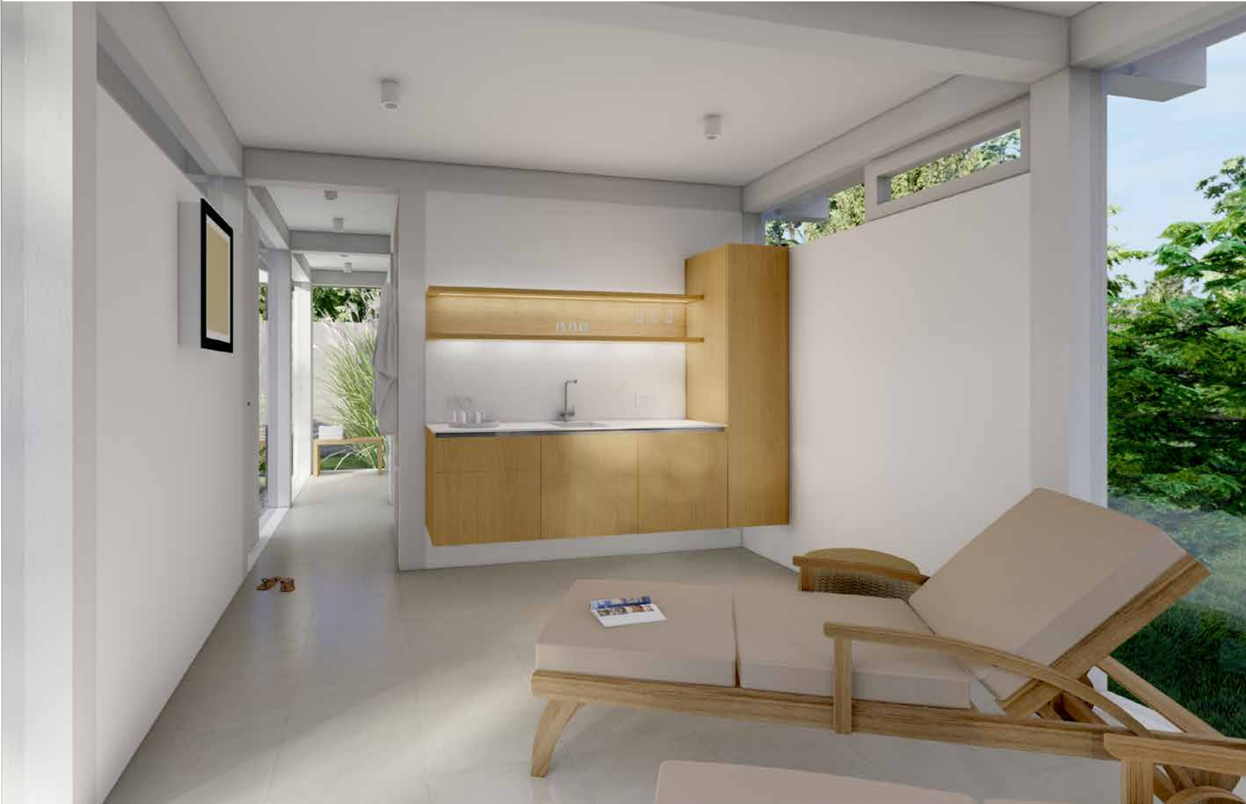
Refreshment after the sauna session: boiling, sparkling or still water from one single tap.