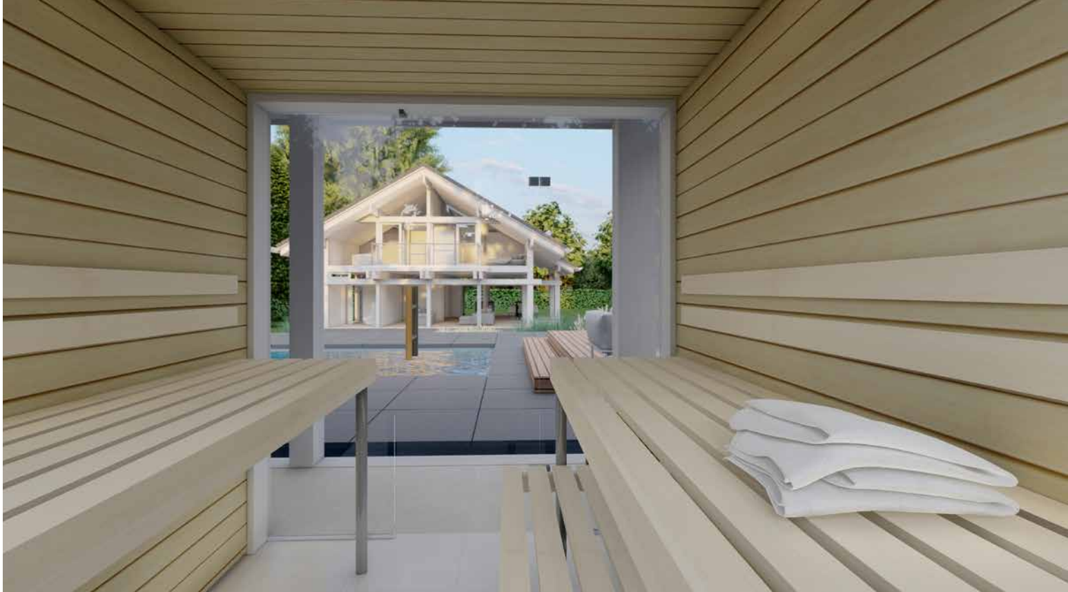
Spacious, comfortable and inviting sauna atmosphere – and a beautiful view to the outside.