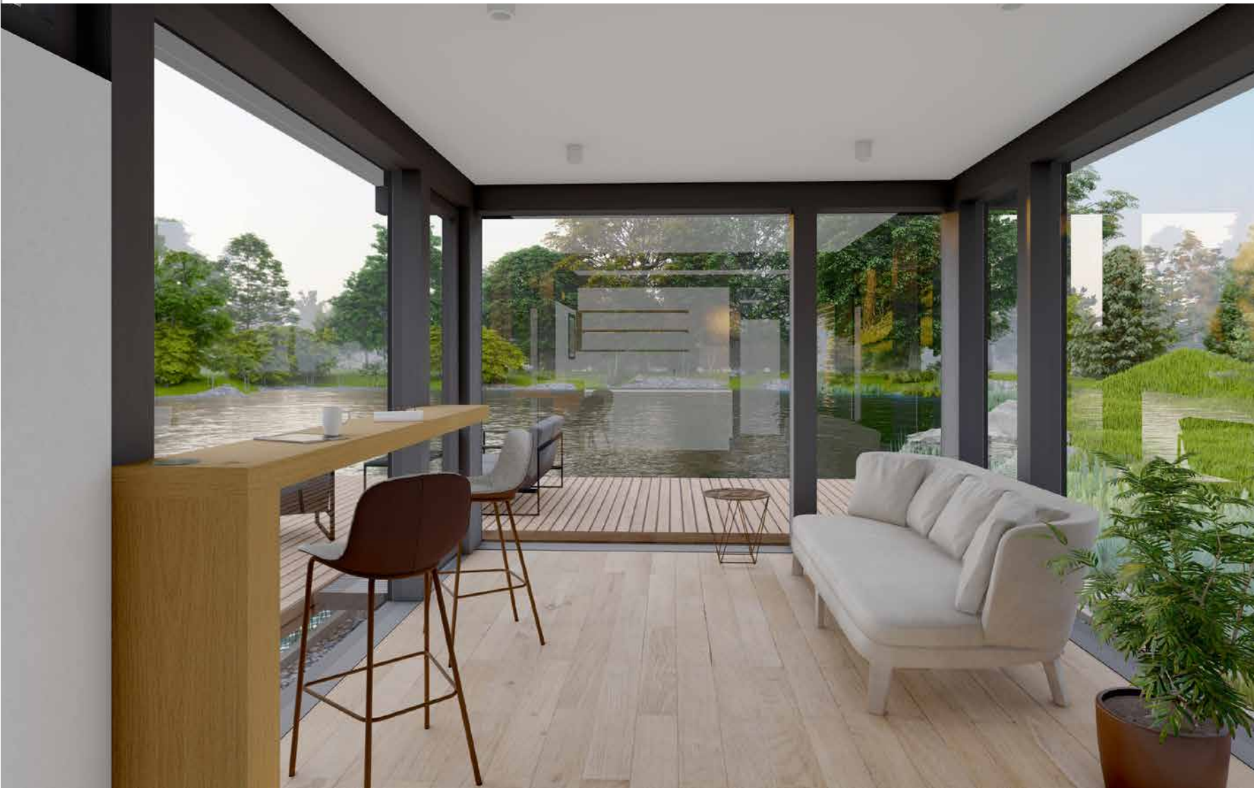
Upon request we include interior as well as exterior lighting in your personalised quote.