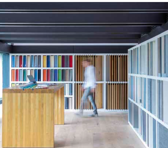
3 FIT-OUT PROTOCOL & FURNITURE CONCEPT