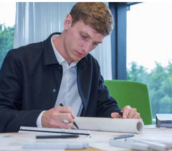
2 DESIGN PHASE & SALES CONTRACT