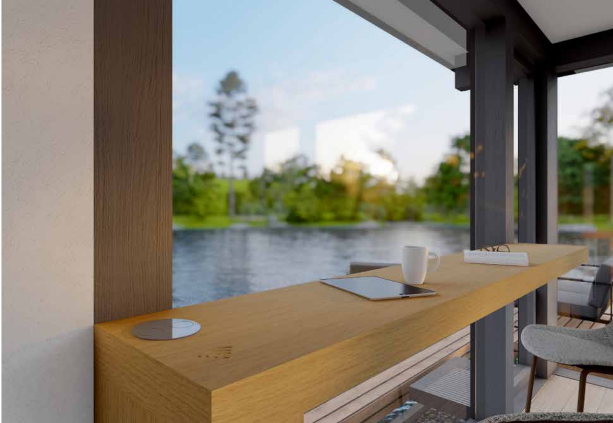
An inductive charging station is integrated into the countertop.