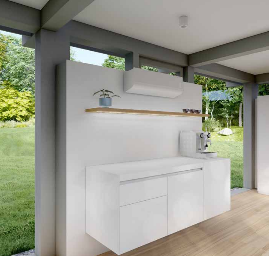
A clever foldable countertop creates additional space whenever needed.