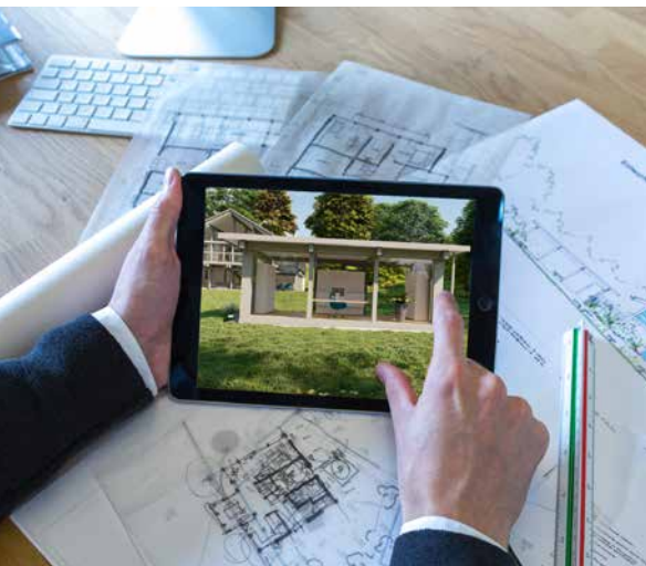
1 PERSONAL CONSULTATION