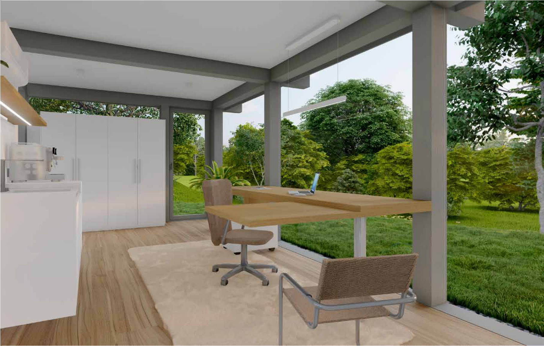
Special feature: the functional desk can be extended.