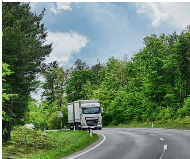
6 TRANSPORTATION & ASSEMBLY