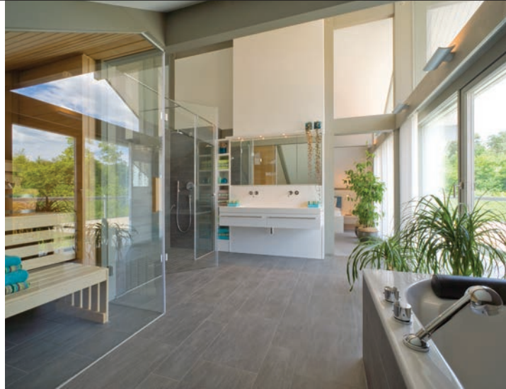
Wellness area for body, mind and soul

Each HUF House is created with the greatest care and devotion, and customer service and after care are of paramount importance in every home we build. Our commitment to our clients is to continue to provide a dedicated service throughout the longevity of their home.