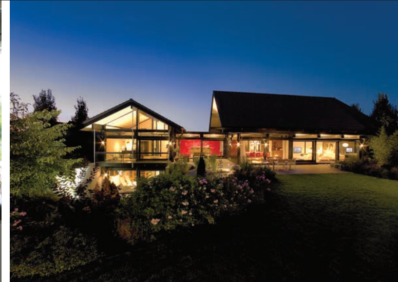
HUF House post re-modeling: plenty of room for new perspectives.